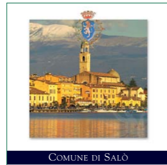
COMUNE DI SALÒ