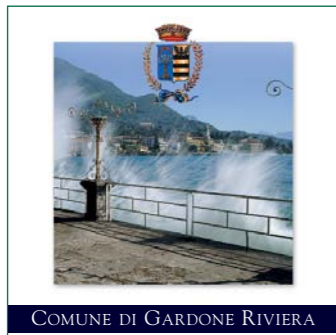
COMUNE DI GARDONE RIVIERA