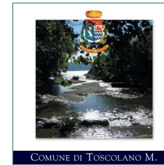
COMUNE DI TOSCOLANO M.