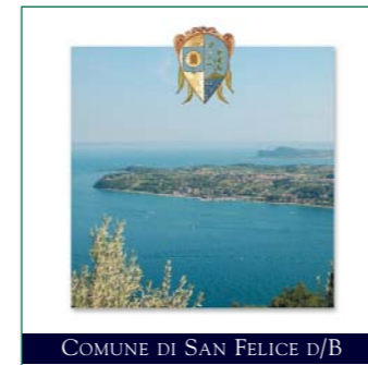
COMUNE DI SAN FELICE D/B